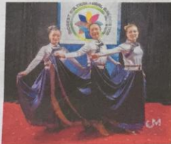
The Chinese Peony Flowers.