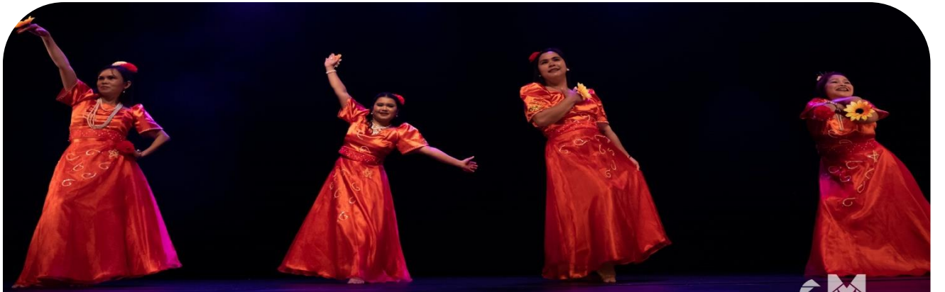
Geraldton Mabuhay Cultural Association