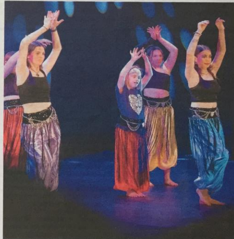
Midwest Community Fusion Belly Dance – Belly Sparkles & Super Novas.