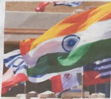
Many flags were flying.