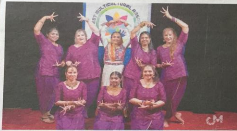
Natya School of Indian Classical & Bollywood Dance.

cased their heritage with the lively dances and beautiful outfits which adds to the cultural splendour of our Geraldton community," he said. "The volunteers put in many hours to ensure the performances conveyed to the audience a unique dimension of art and culture."