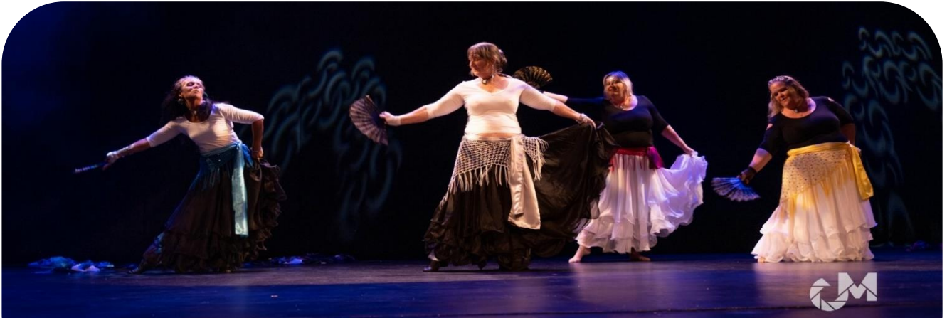
Midwest Community Fusion Belly Dance