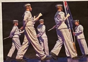
TS Morrow Australian Navy cadets on stage.