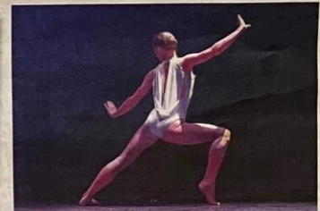
A ballet dancer from All Things Dance.