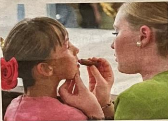
A performer gets make-up done.