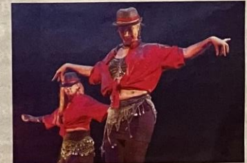
Midwest Community Fusion Belly Dance Group.

"The multicultural concert is an opportunity to come together and celebrate the richness of our cultural diversity, the inclusiveness, respect and a sense of belonging for everyone who calls the Mid West home," she said.