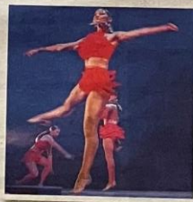
Dancers from All Things Dance.

The Midwest Community Fusion Belly Dancers, All Things