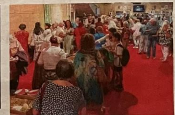
A busy Queens Park Theatre foyer.