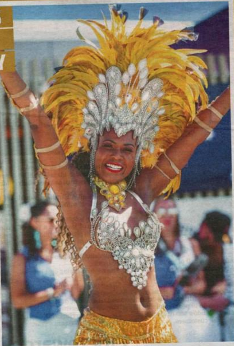
Brazilian band Sambozzy made their way to Geraldton for Harmony Day.