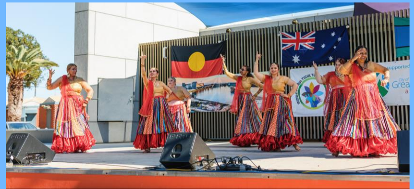
Natya Classical & Bollywood Dance School