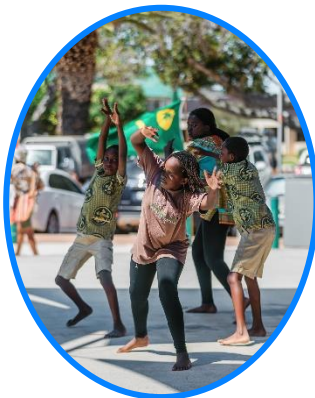
Midwest African Association