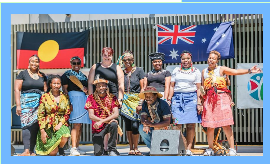
Midwest African Association