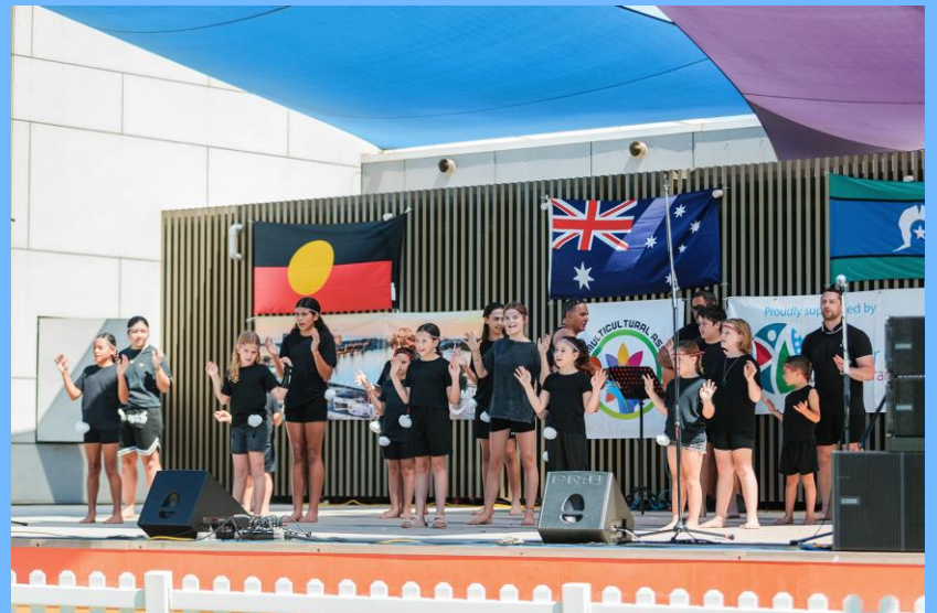
Geraldton Kapa haka Te Whanau Manaaki