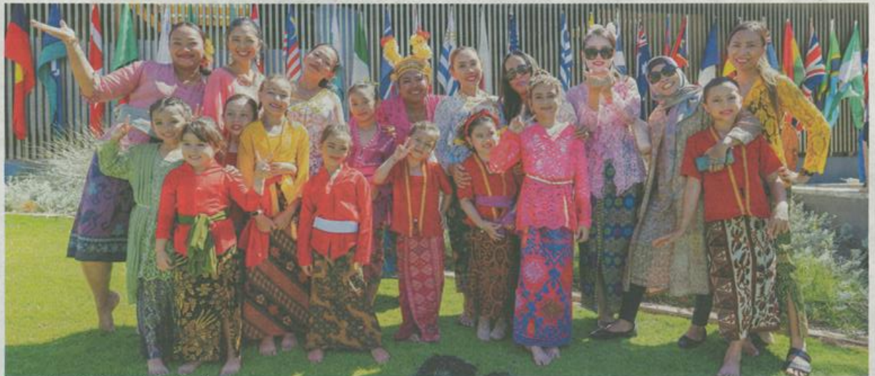
Pesona Indonesia Pictures: Mullermind Creative