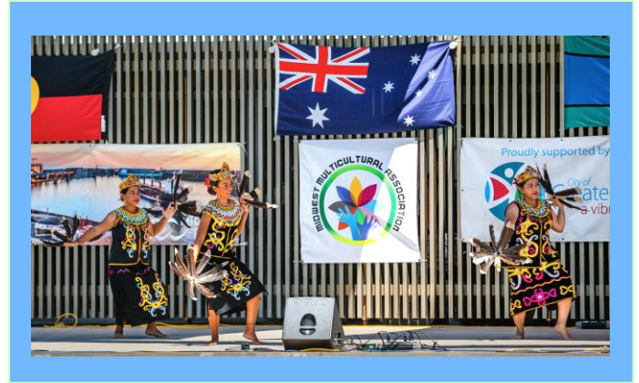
Geraldton Indonesian Group