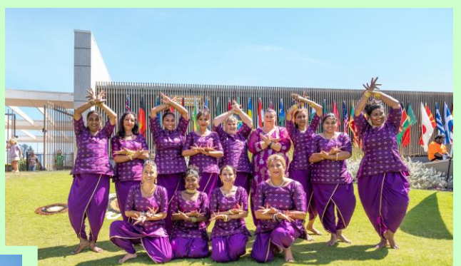
Natya Classical & Bollywood Dance School

Name Your Country of Birth was a popular activity with fifty five people being added to the database to receive advance notice of MWMA activities.