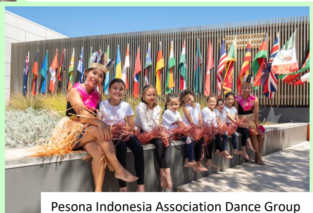
Pesona Indonesia Association Dance Group