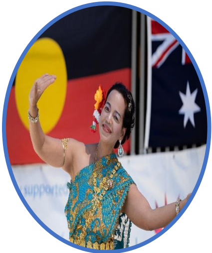
Geraldton Thai Community