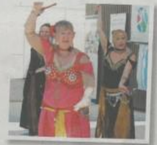
Combined belly dance troupe.

The Harmony Day Festival will run from 11am to 3pm on Saturday, March 18.