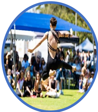
All Things Dance