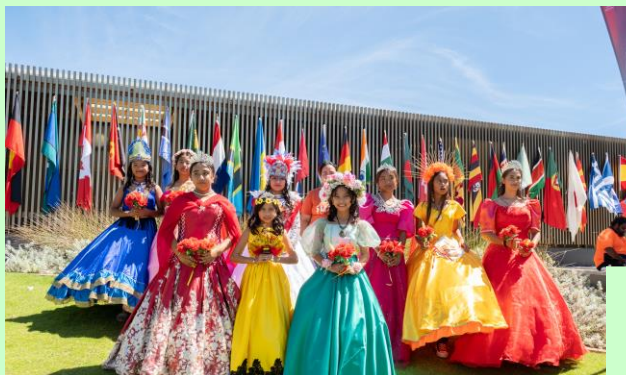
Geraldton Mabuhay Cultural Association

Birds from around the world travel to the Midwest for the summer and from March begin flying thousands of kilometres up the coast of Western Australia, through countries such as Indonesia, Thailand, China and Japan to return to Russia and Siberia for nesting