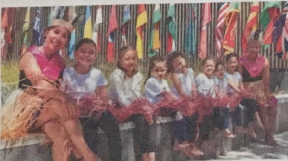
Members of the Pesona Indonesia Association Dance Group.