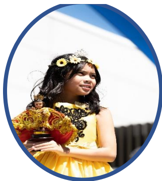
Geraldton Mabhay Cultural Association