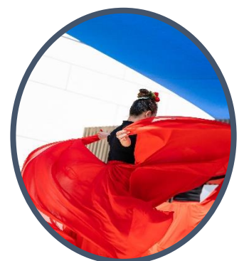
Back of program