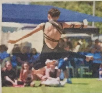
Dancers entertain the crowd.