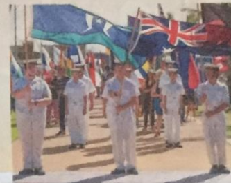
Naval Cadets march in the flags.

He said there was a great turnout and thanked locals for their support. "It's great that we can be supported by the community," he said.