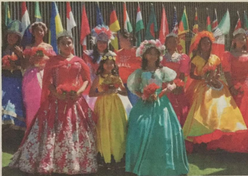
Dancers from the Geraldton Mabuhay Cultural Association.