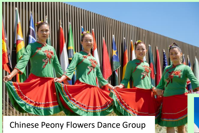
Chinese Peony Flowers Dance Group