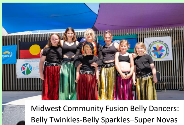
Midwest Community Fusion Belly Dancers: Belly Twinkles-Belly Sparkles-Super Novas