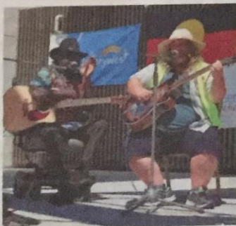
The Walalgie Band.