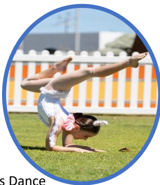
All Things Dance