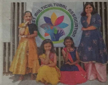
Natya School of Indian Classical and Bollywood Dance pupils.