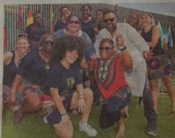
Members of the Mid West African Dance Association.