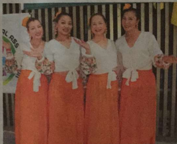
The Chinese Peony Flower dancers.