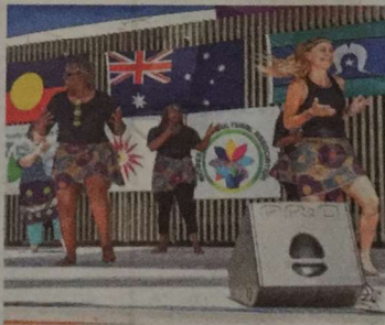
Mid West African Dance Association on stage.

The bright colours of national costumes, the electric dance movements and the spirit of inclusivity and happiness were in abundance at the Geraldton foreshore for the recent Harmony Festival.