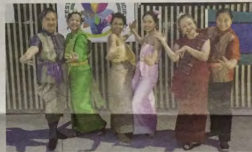
Geraldton Thai Community Dance Group.