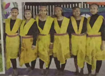
Indonesian dancers.