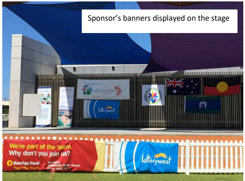
Sponsor's banners displayed on the stage