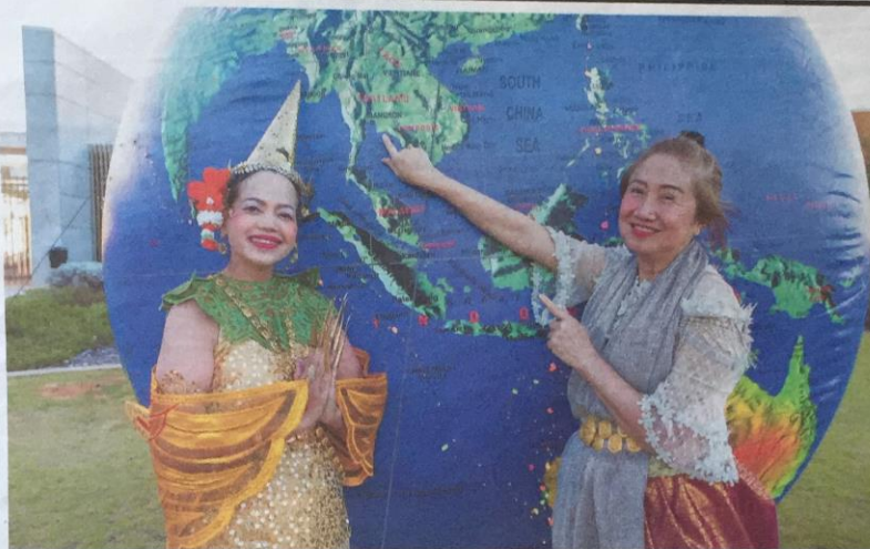
Performers from the Geraldton Thai community.