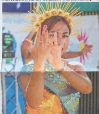
A dancer from Pesona Indonesia.