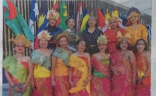
The Pesona Indonesia Dance Group.