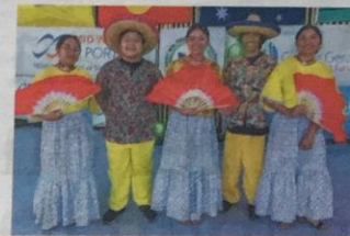
The Geraldton Mabuhay Dancers.