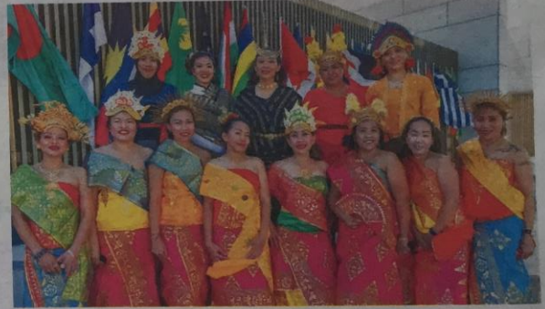
The Pesona Indonesia Dance Group.

The festivities continue this week with the Multicultural Concert on Saturday, November 12.