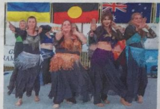
Natya Indian and Bollywood Dance Troupe.