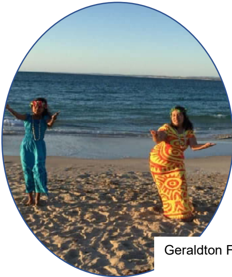
Geraldton Fijian Association