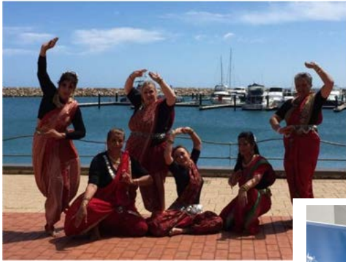
Natya Classical Indian & Bollywood