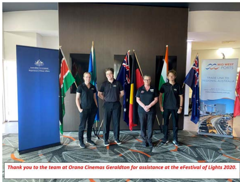
Thank you to the team at Orana Cinemas Geraldton for assistance at the eFestival of Lights 2020.