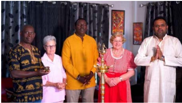
Lighting of the Lamp: (Deepa Jyoti)